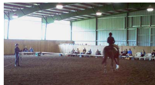
A Participating Instructor helps a demonstration rider improve her position during the May Lunging the Rider Workshop.